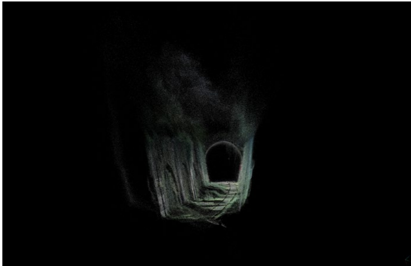
Daniel Bourgeois, La ceinture, paysages invisibles, 2024 Photogrammetry, Translucent printing on Diffusant 3 mm Negatoscope 74 x 49 cm