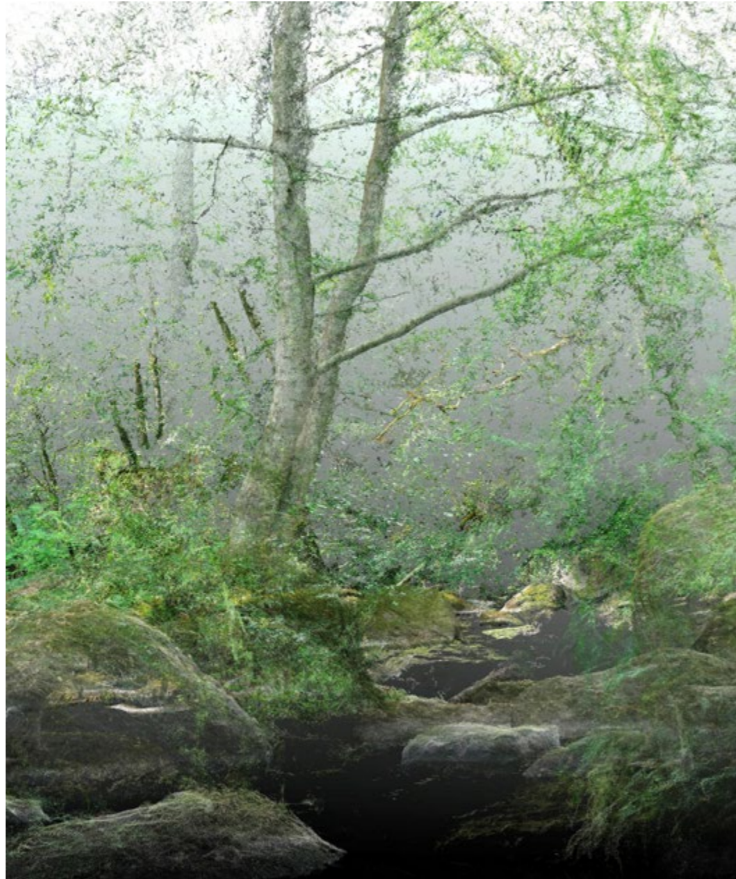
Daniel Bourgeois, L'Orne, Normandie, 2023 Photogrammetry, printing on Diffusant 3 mm Negatoscope, lightbox, raw oak frame 130 x 98 cm Unique piece