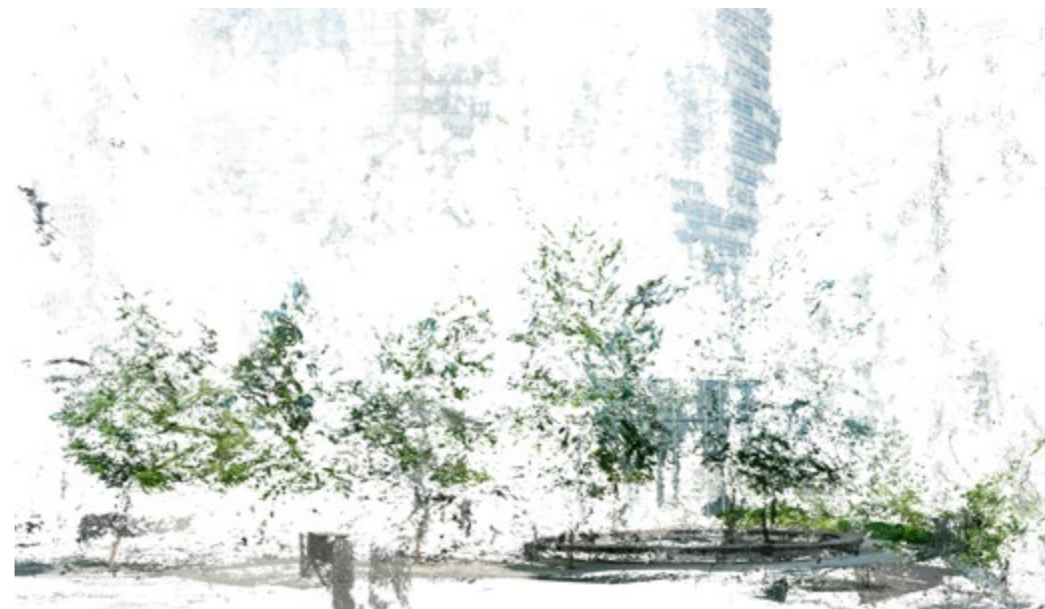
Daniel Bourgeois, La Défense, textures III, été 2023 Photogrammetry, print on Awagami paper White ceruse wood frame 91.6 x 53.6 cm Edition of 3 + 1EA

His approach involves removing certain elements of reality to question the visible image, akin to fragmented memory, as an experiment on the perception of imagery and memory. It is the shifting gaze that brings about an awareness of one's environment.