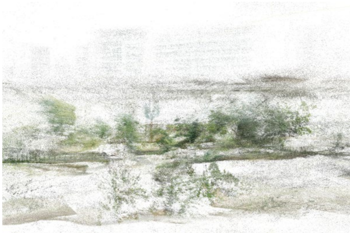
Daniel Bourgeois, Jardin de l'Arche, paysage en mouvement V, été 2023 Photogrammetry, print on Awagami paper White ceruse wood frame 71.6 x 41.6 cm Edition of 3 + 1EA